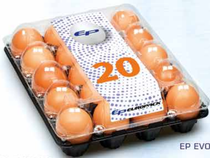
EP EVO 1x20 Jumbo

EUROPACK offer new concept family packaging for 20/24/30 eggs which brings new possibilities for shelf presentation and also to enable better packing centre efficiencies together with possible cost reduction