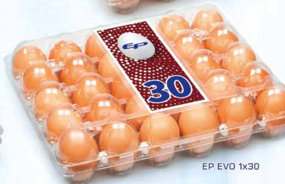
EP EVO 1x30