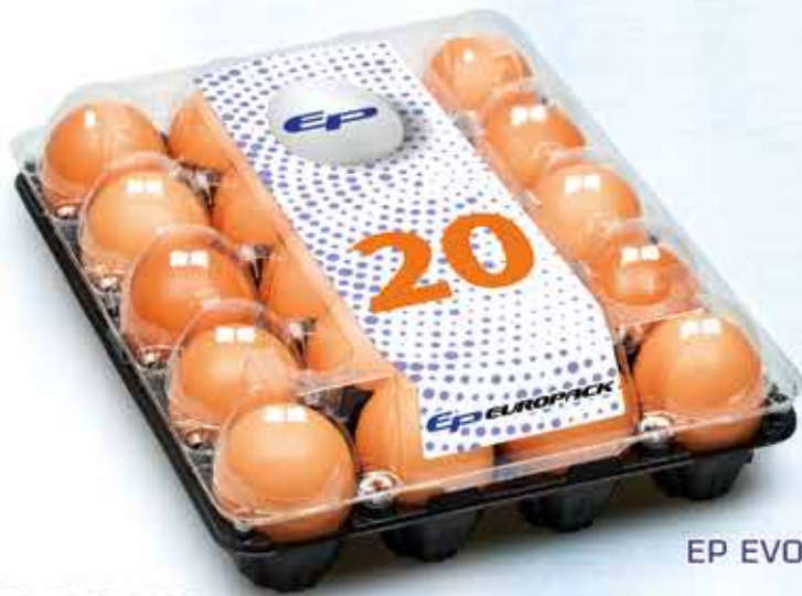
EP EVO 1x20 Jumbo

EUROPACK offer new concept family packaging for 20/24/30 eggs which brings new possibilities for shelf presentation and also to enable better packing centre efficiencies together with possible cost reduction