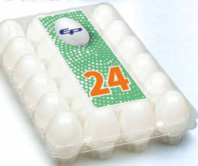
EP EVO 1x24