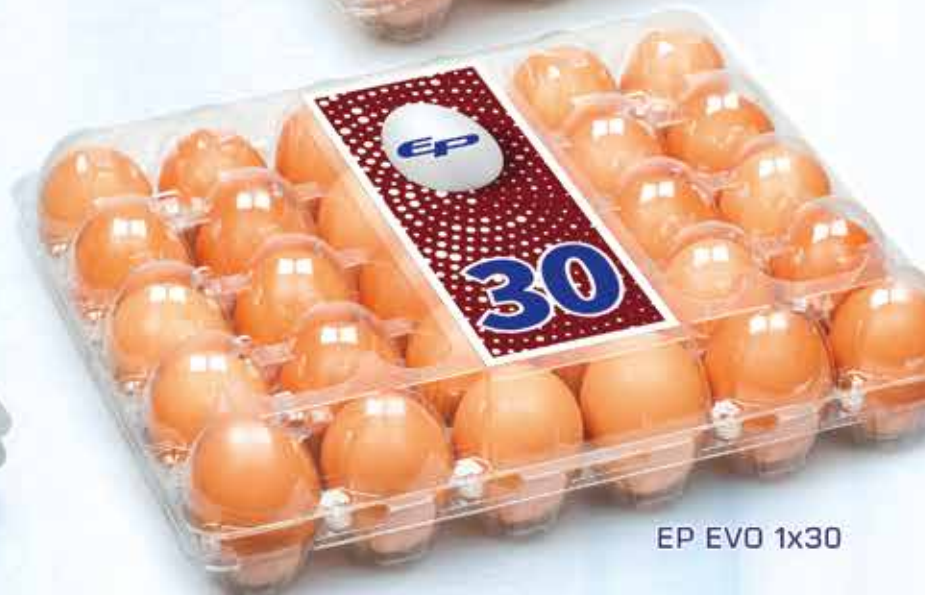
EP EVO 1x30